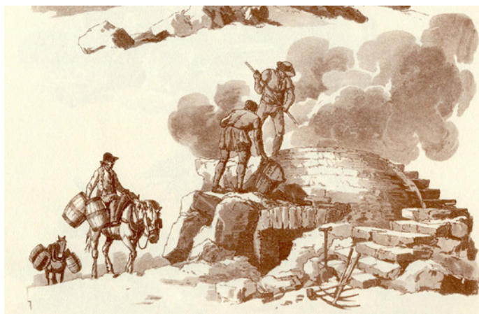
Lime burning in the nineteenth century