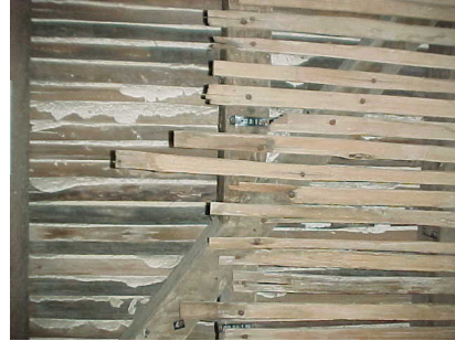
Whittaker's Cottages with Interior detail showing timber frame, render and lath.