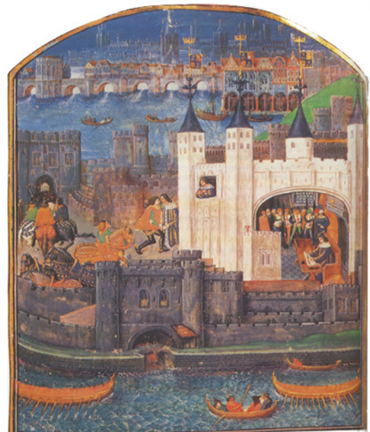
The White Tower, with coloured timber framed buildings in the background